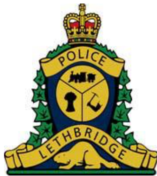
Lethbridge Police Service supports safe handling, use and storage of all firearms.

DEVELOP SAFE SHOOTING HABITS, AND REMEMBER, FIREARMS SAFETY IS UP TO YOU.