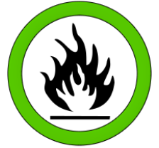
Burn Ban Lifted

Check Alberta Firebans website ( https://albertafirebans.ca ) or the Lethbridge County website for any Fire Ban updates.