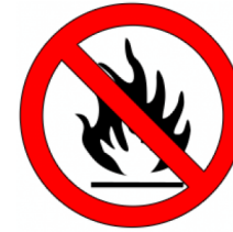
Burn Ban In Effect