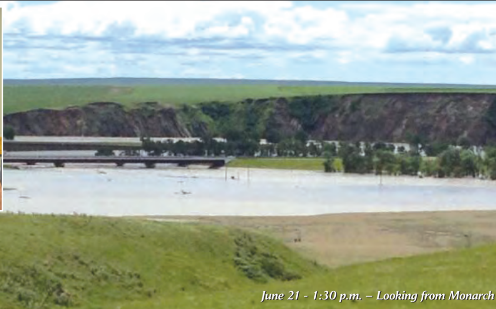
June 21 - 1:30 p.m. – Looking from Monarch