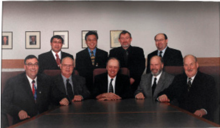
County of Lethbridge Council