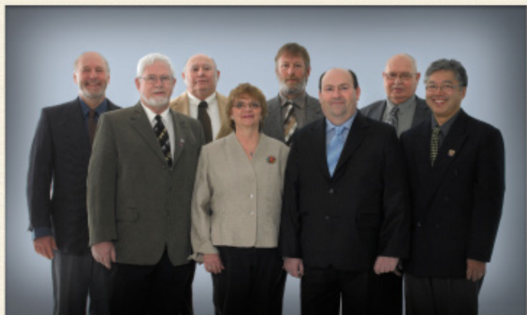
County of Lethbridge Council Elected October 2007